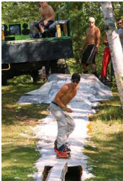
Much fun can be had at K-day. Drinking aside.

Luckily, the jour- ney has since changed (read as: improved), but the fun re- mains the same. Whether you drive, take the bus, hitchhiker, waterski, llama ride, or bum a ride from a friend, getting to and from McLain State Park has never been easier! This year expect to see The Daily Bull, WMTU, CRU, Volleyball Club and many more student organi- zations getting out there and inform- ing you why they are worth your time.